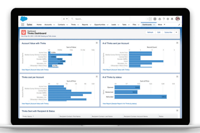
Build customer reports and dashboards to track effectiveness and utilization of Thnks across your team.